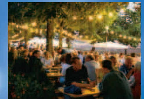
Experience and Enjoy Bremen! > page 10