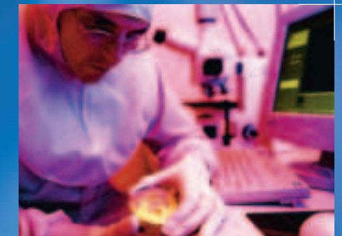
High-Qualified Workforce Potential > page 8

Bremen is in lane to innovation. This high-tech city is booming: an I&C location that boasts unique expertise for mobile solutions. The city's infrastructure, qualified workforce, brain network and quality of life all add up to a first-class address for pioneering companies.