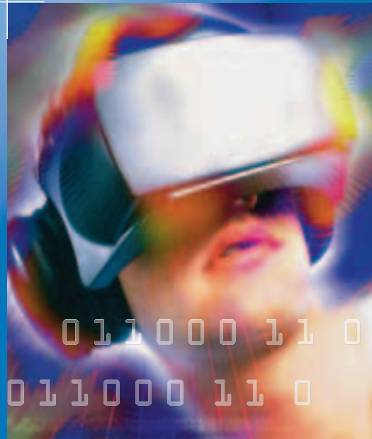
Bremen Set for Innovation: Mobile Solutions > page 5

Bremen is in lane to innovation. This high-tech city is booming: an I&C location that boasts unique expertise for mobile solutions. The city's infrastructure, qualified workforce, brain network and quality of life all add up to a first-class address for pioneering companies.