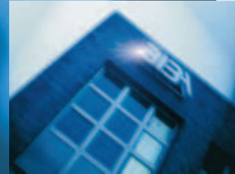
Science and Development: Enhancing Bremen's Image > page 8