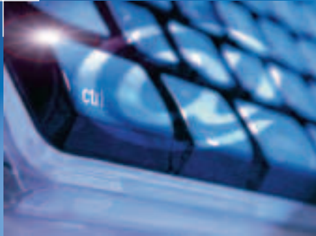
Head Start for I&C Enterprises > page 4