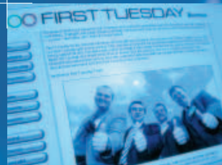
Brainpools and Dynamic Networks > page 6