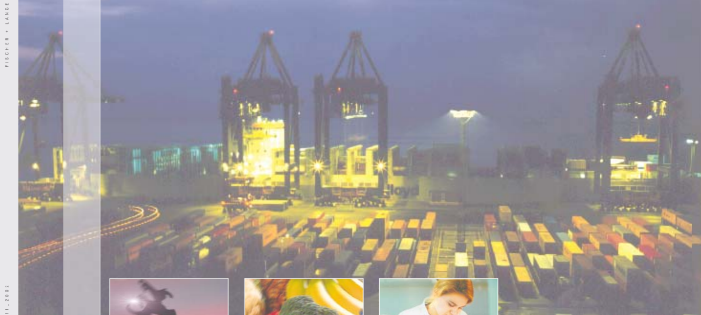
FISCHER + LANGE 11_2002